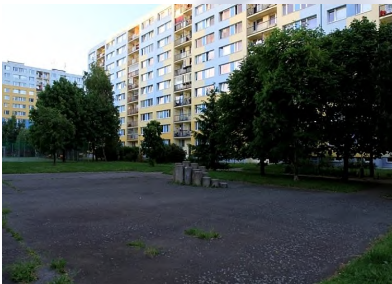
Inner courtyard before revitalization

Situated on the south from the centre of Prague city centre, Prague 11, one of the fifty seven quarters of the capital, has nearly 80.000 inhabitants. The majority of them have been living in high-rise blocks of flats, built in the 1970s and 1980s. Obviously, these housings estates have become obsolete and in recent years have been subject to renovation and revitalization to enhance their residents' living conditions from environmental, economical as well as aesthetic points of view.